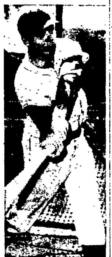
GIL IN SHAPE—Gil Hodges, slugging first baseman of the Los Angeles Dodgers, shows his batting eye is plenty sharp as he gets a hit in a Vero Beach, Fla., workout.