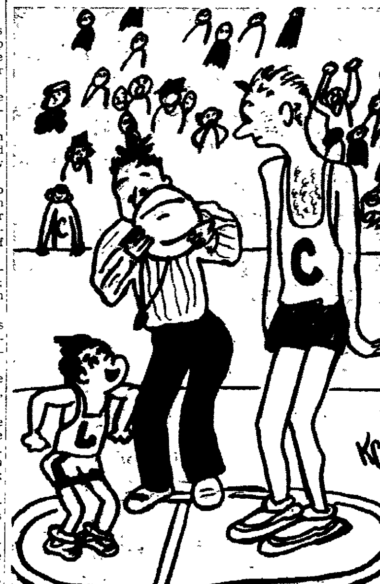
"Toss it up, Ref! I eat my Wheaties!"

More than 14 thousand farm residents are killed by accidents annually and more than one million injured.