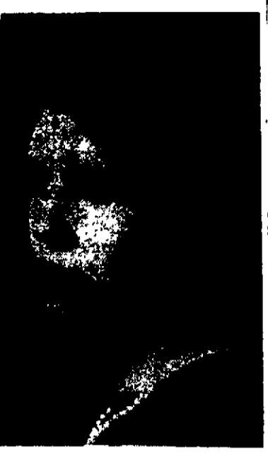
Sandye Atkins